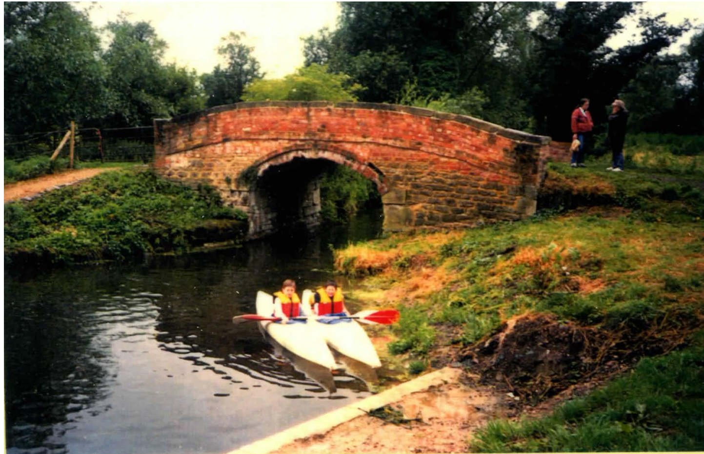
CALNE - Chaveywell Bridge restored.